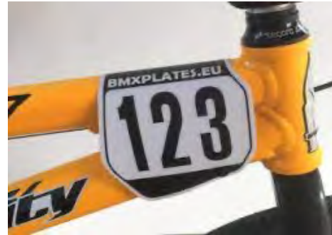
Side Plate (Lateral Number plate)