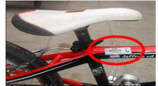
Bike stickers (Barcodes)

Wrist bands must be worn at all times and match the barcode on your bike