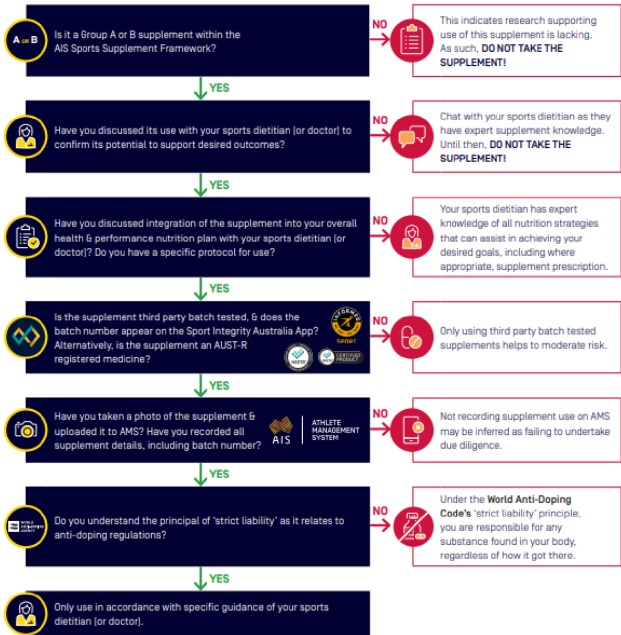
Diagram 2 – The below diagram provides key steps to consider before using a supplement.

AIS Supplement tree: https://www.ais.gov.au/_data/assets/pdf_file/0008/1082519/AIS-Supplement-Framework-Decision-tree_v6.pdf