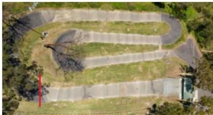
Location of transponder loop

"The rider (from the categories listed in 5.2.1) with the fastest recorded time in SQORZ, from the start hill to the end of the first straight, will be awarded the Fastest First Award . Times will be taken from Motos, Qualifiers, and Finals to determine the overall winner